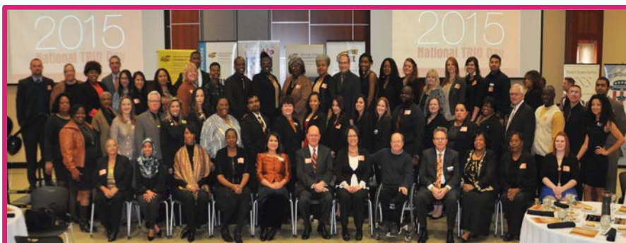
Office of Special Programs Staff