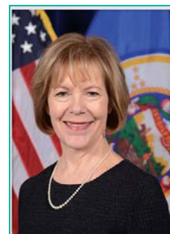
Lt. Governor Tina Smith

The members of MN TRIO left the conference better prepared to lead students toward success.